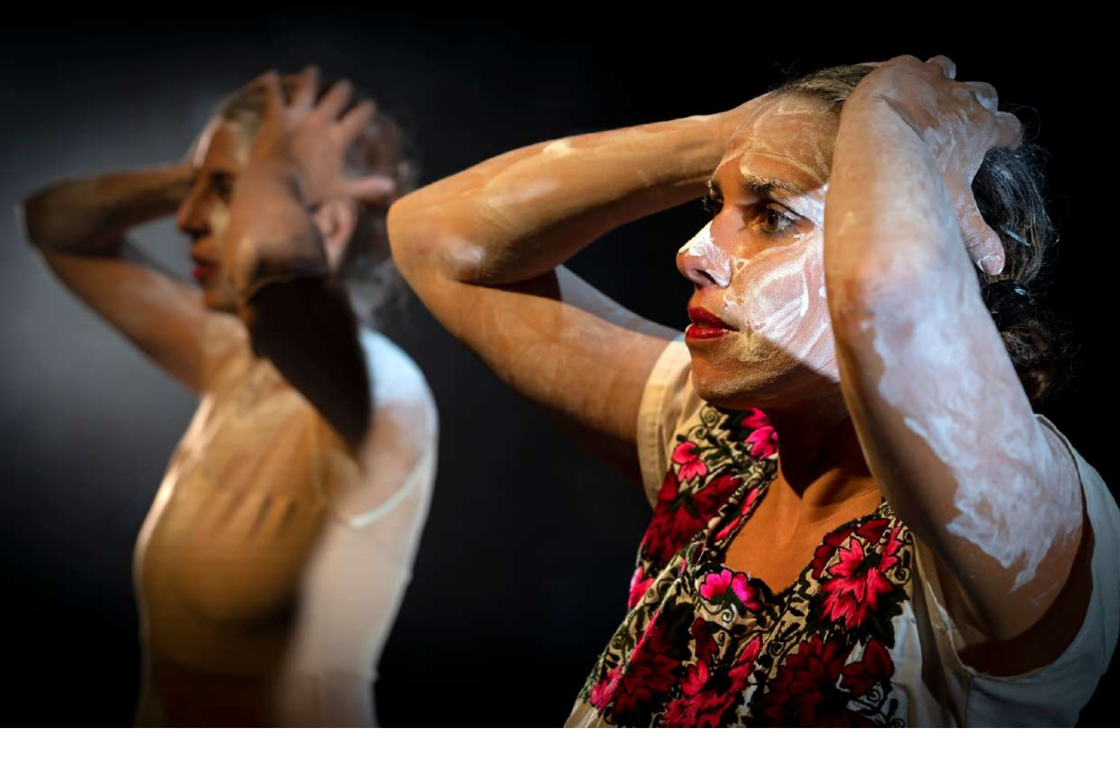
Resilience : ability to overcome traumatic circumstances such as the death of a loved one, an accident...